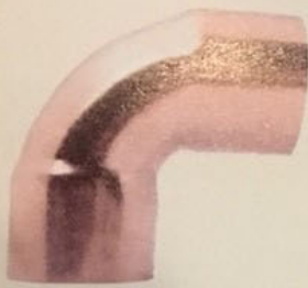
ข้ออทองแดง 90° 90° ELBOWS