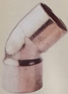
ข้ออทองแดง 45° 45° ELBOWS