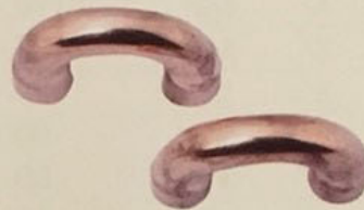
ข้อโค้งทองแดง 180° 180° RETURN BEND