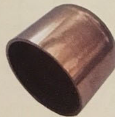
ฝาปิด TUBE CAP